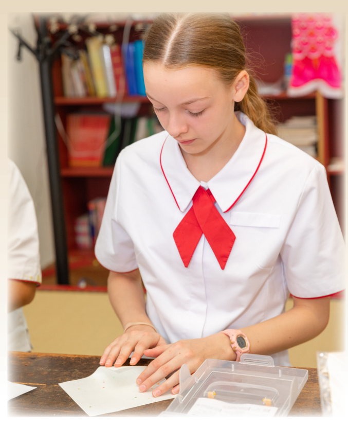
Empowering young women in a changing world