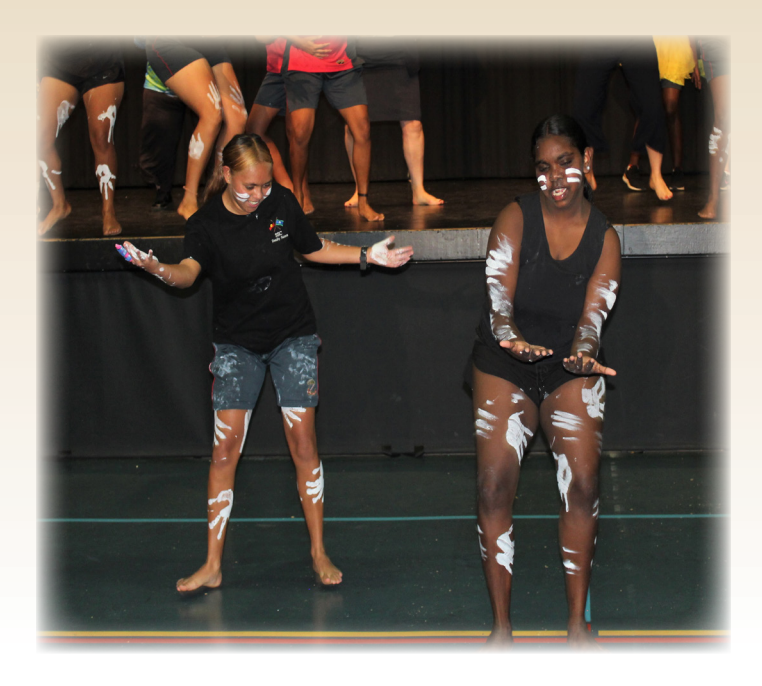
Empowering young women in a changing world